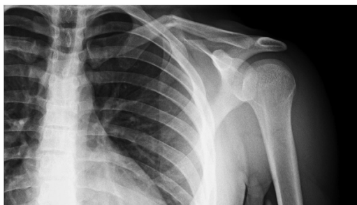
Fig. 2. Anteroposterior clavicle view showing left clavicle fracture.

Radiographs at 8 weeks postoperatively showed fracture union ( Fig. 3 ), and he demonstrated full strength and range of motion in therapy. He participated in receiving